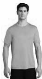
ST420 Sport-Tek® Posi-UV™ Pro Tee

The DEADLINE for T-Shirt orders is September 22, 2021