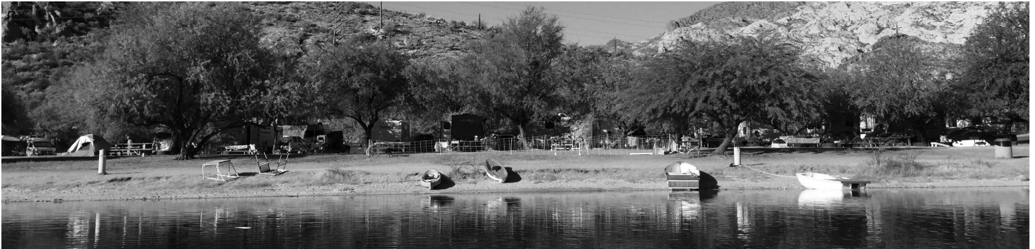
Canyon Lake Marina Campground Beach