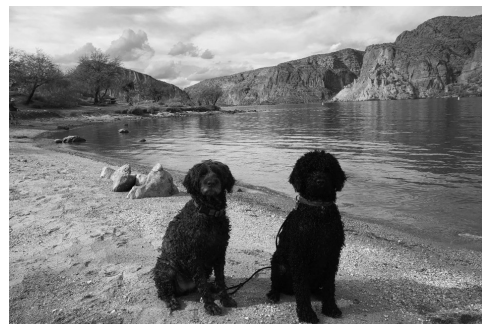
Canyon Lake near Palo Verde Boat Launch