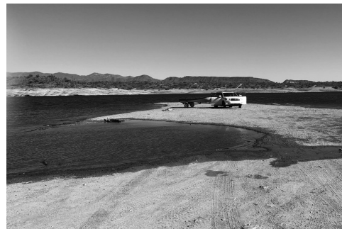
Lake Pleasant near Castle Hot Springs Boat Ramp