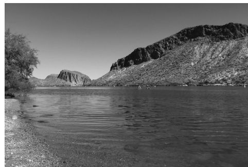
Canyon Lake Marina Campground Beach