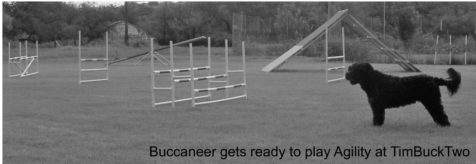
Buccaneer gets ready to play Agility at TimBuckTwo

Although Virtual Agility Trials were initially designed for people who live in remote areas, and a far distance from NADAC trial locations, many agility clubs now host Virtual Agility Trials. Check with your local club to see if they offer them, and when they will resume after this Covid 19 pandemic has subsided.