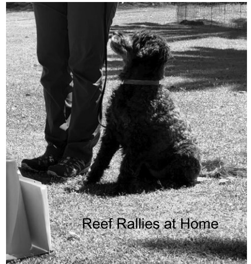
Reef Rallies at Home