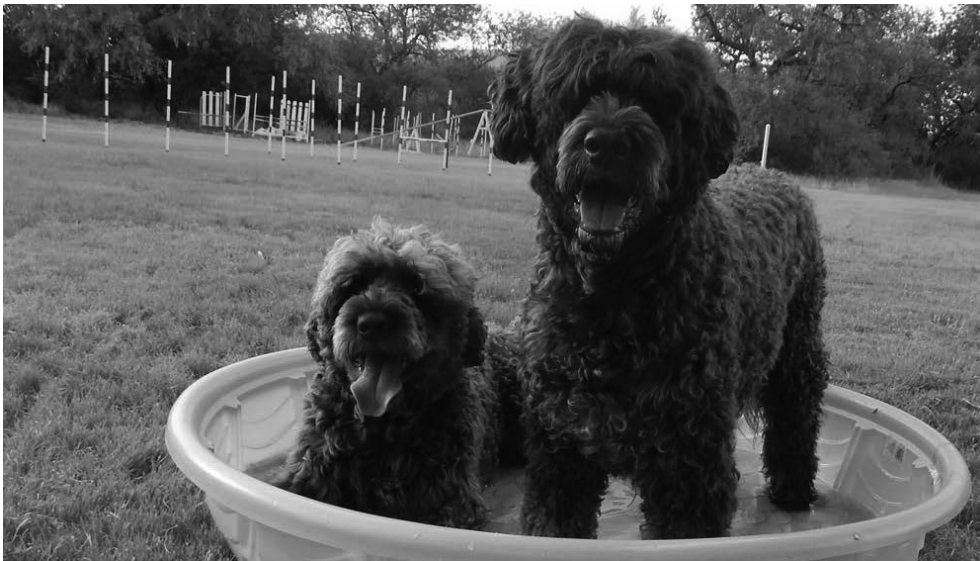
Doublon and Woof take a cool break from agility