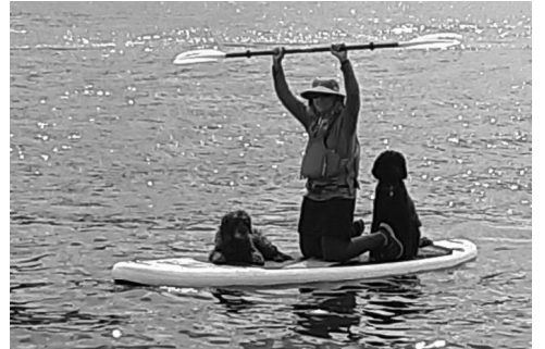
Reef and Hope