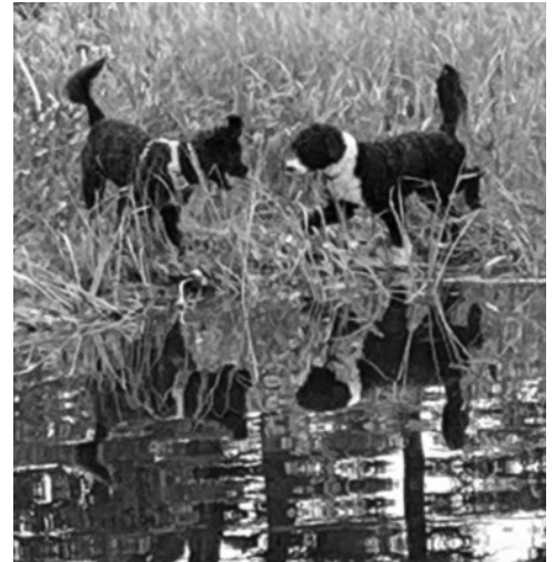
Reacher and Zico Play Shoreside

Information about Canyon Lake can be found here: https://www.fs.usda.gov/recarea/tonto/recreation/wateractivities/recarea/?recid=35545&actid=78