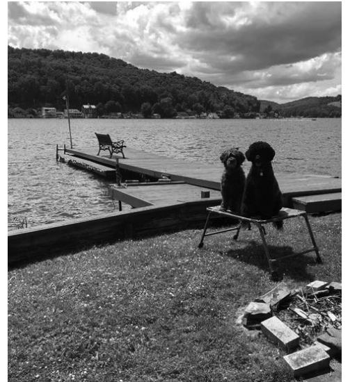
Reef and Hope on vacation