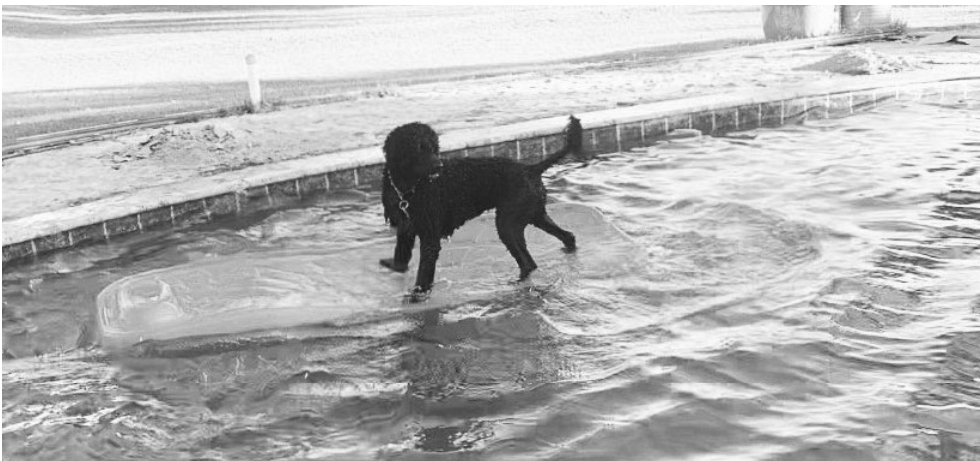
Cali surfs the waves on the pool float