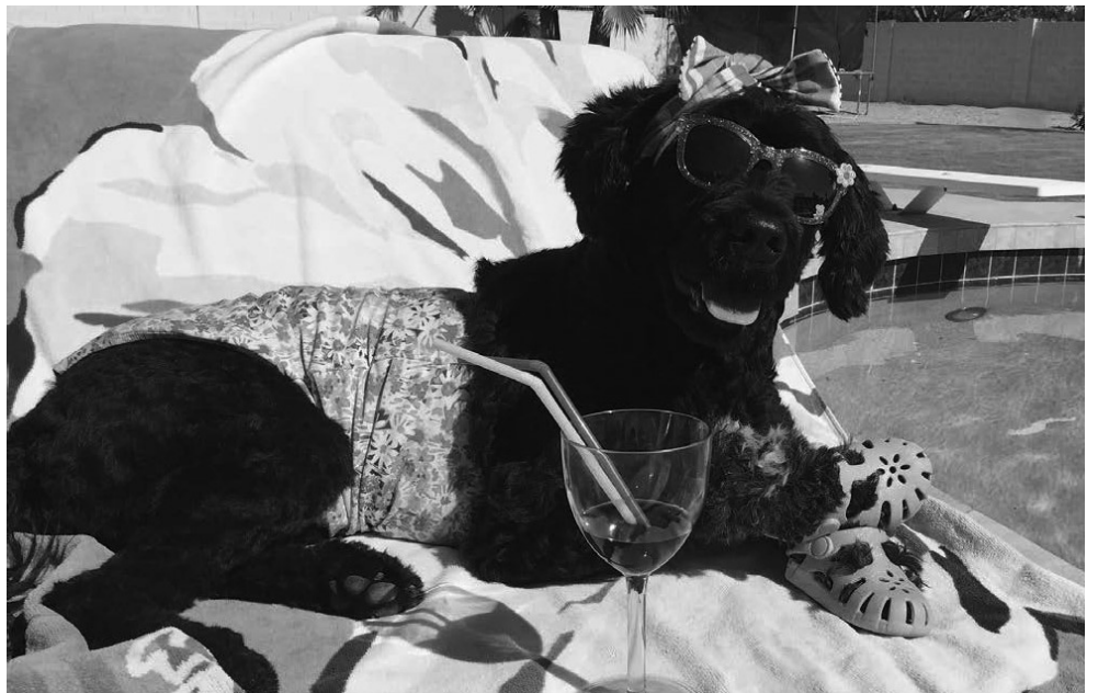
Poppy enjoying pool time