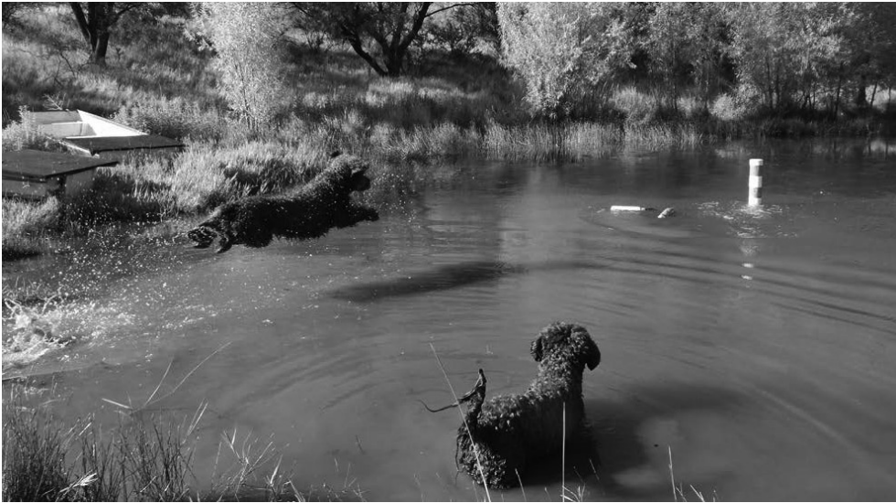
Doubloon and Woof at the pond