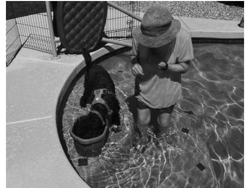
Reacher practices the Apprentice level underwater retrieve