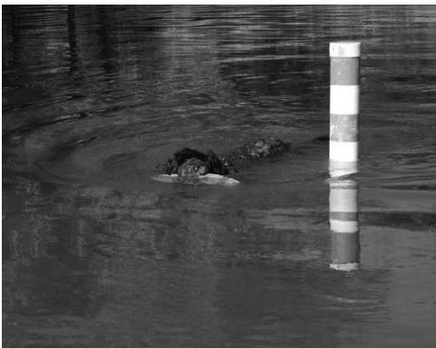
Woof retrieves in the pond