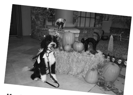
Katie—The Bumble Bee