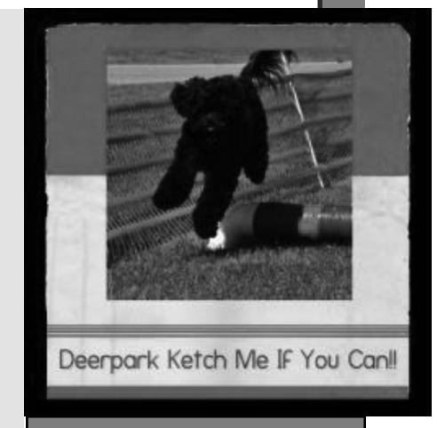
"KC" - Owned by Cathy Larsen was the wine label contest winner!