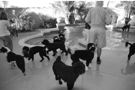
In the WATER!!!