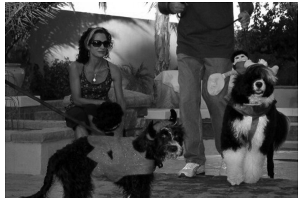
Tig the devil pup & Bugsy, as Rodeo Rockstar!