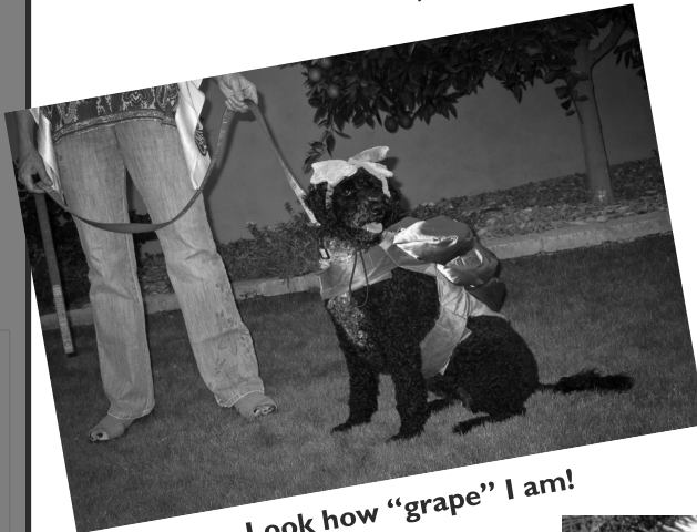
Look how "grape" I am!

We do not publish any litter, birthday or passing of a dog unless information is submitted.