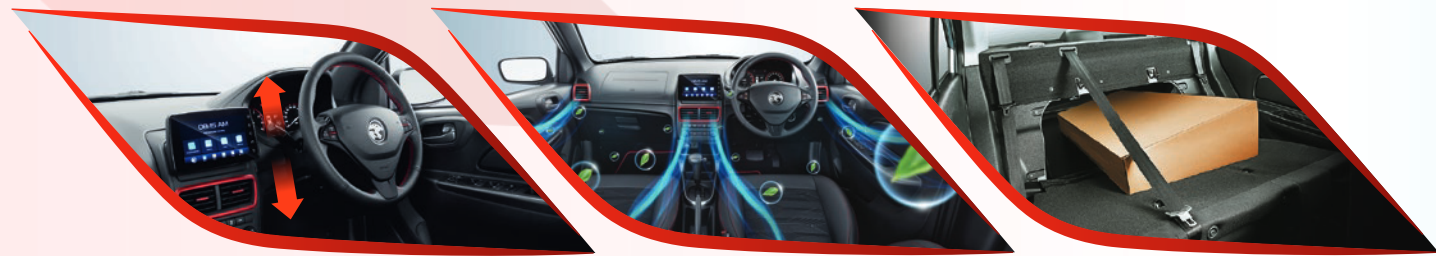
Steering Tilt Adjustment