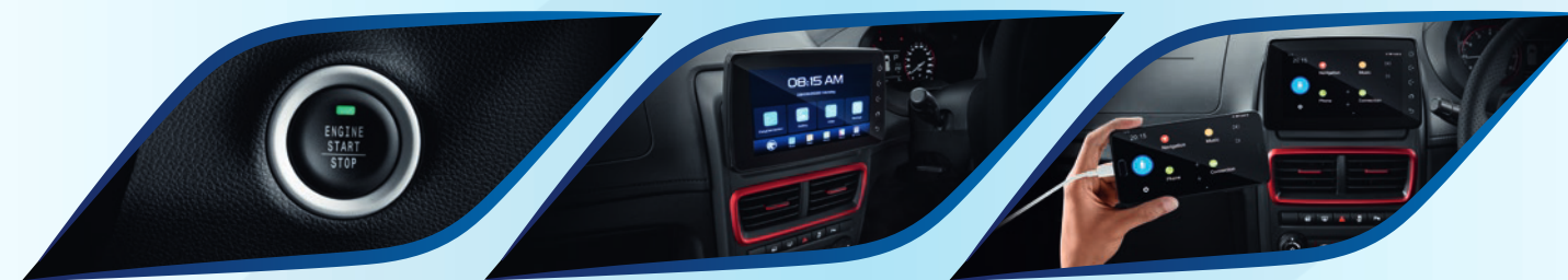
Push Start Button