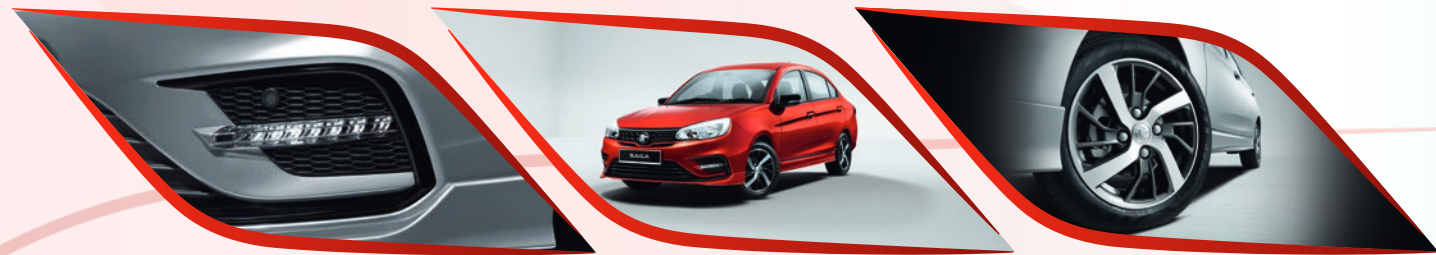
LED Daytime Running Lamps

With features that make your driving experience smoother, you can now turn your attention to the important matter of getting ahead.