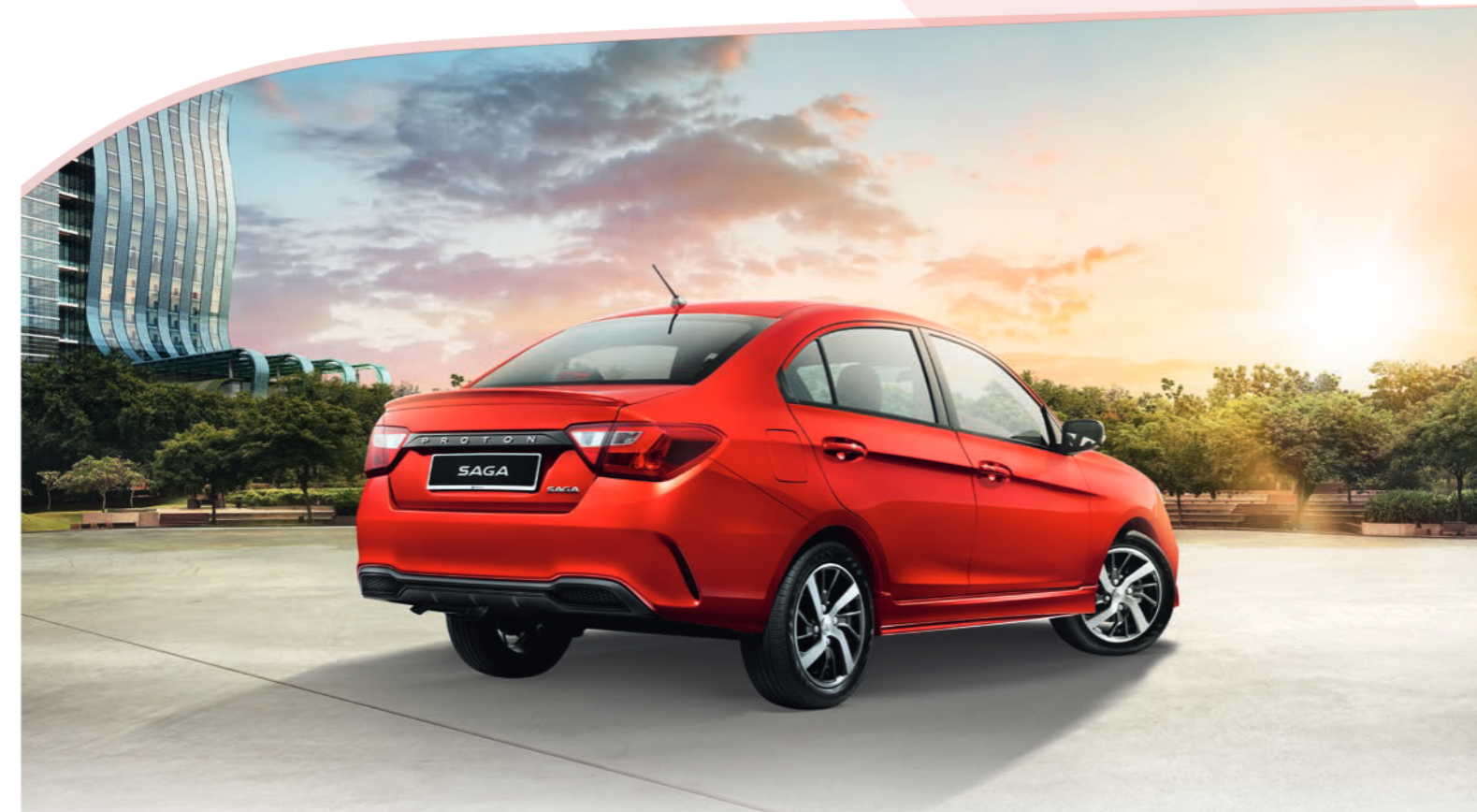
1.3L Premium S AT Semi Leatherette with Fabric