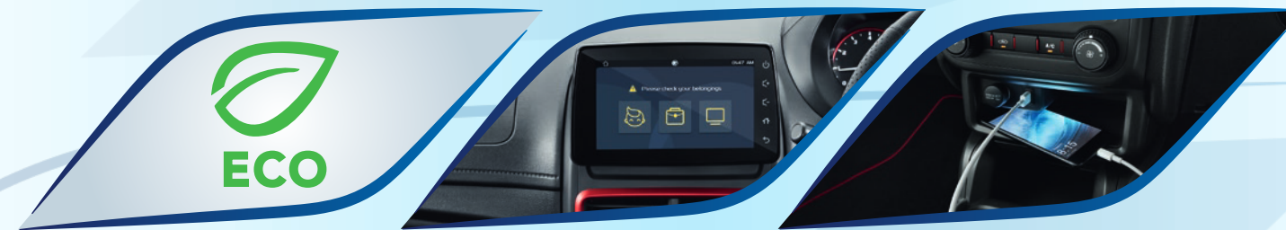
ECO Drive Assist