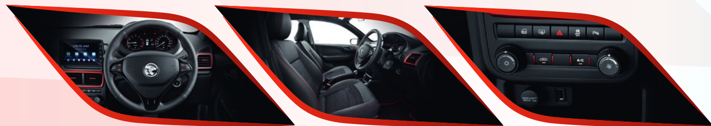
Leatherette Steering Wheel with Switches