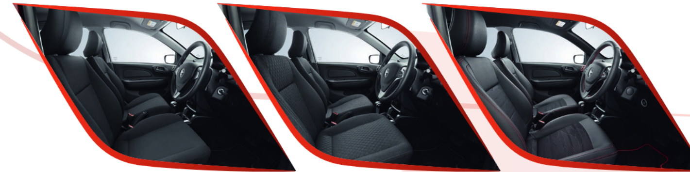
1.3L Standard AT Fabric