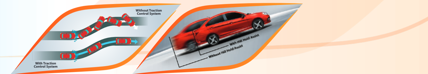
Electronic Stability Control and Traction Control System