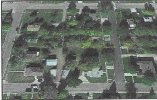
525 Jefferson Aerial