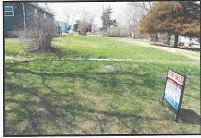
525 Jefferson Street, Winner, SD 57580 MLS #22-139