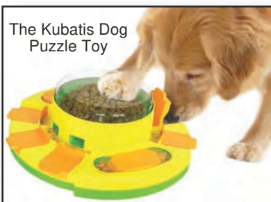
The Kubatis Dog Puzzle Toy

CHECK OUT THE KUBATIS DOG INTERACTIVE TOYS ON AMAZON TODAY!