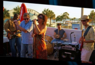
My Viking Funeral