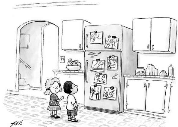
"I approach my subjects with an almost childlike sense of wonder."