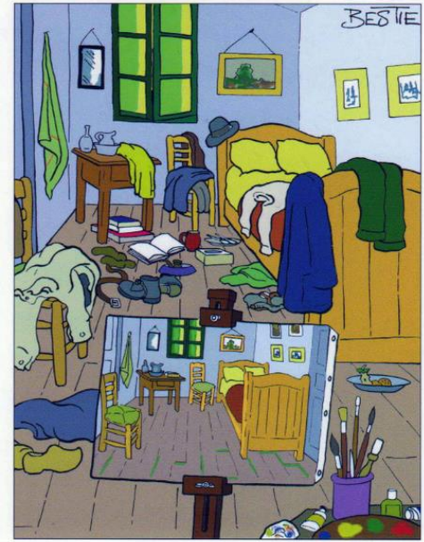
LIKE A LOT OF CREATIVE PEOPLE, VAN GOGH DIDN'T SEEM TO SEE THE CLUTTER