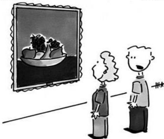
"I don't think it's a metaphor for anything. I think it's a bowl of fruit."