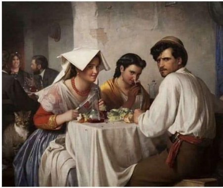
That feeling when you go out for a quiet meal and some guy at the next table starts painting you.