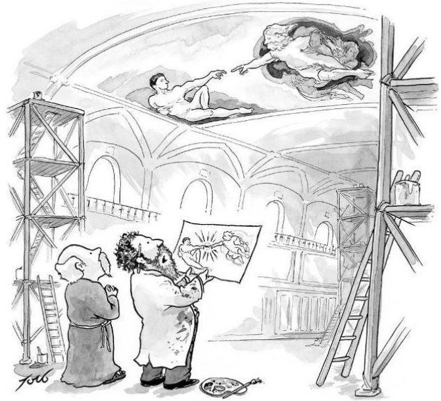
"The ceiling is slightly wider than I'd planned."