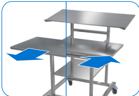
Shelf pulled out.

Easy position adjustment with foot-activated release.