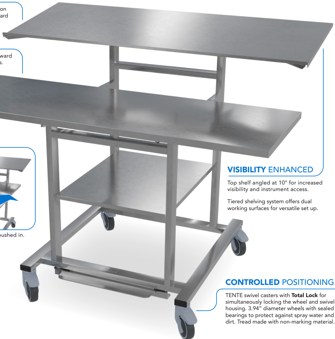
Shelf pushed in.