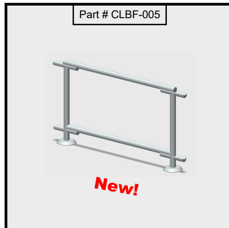
Chain-link Barrier Fence Straight 1-Section HO Scale (1/87)