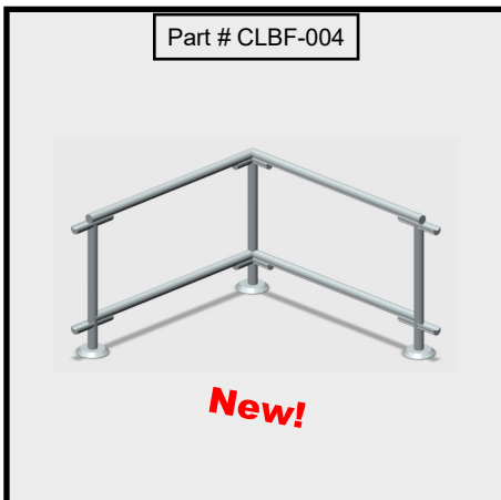
Chain-link Barrier Fence 90 deg. Corner HO Scale (1/87)