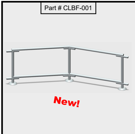
Chain-link Barrier Fence 30 deg. Corner HO Scale (1/87)