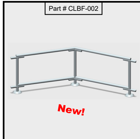
Chain-link Barrier Fence 45 deg. Corner HO Scale (1/87)