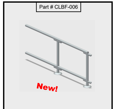
Chain-link Barrier Fence Straight 2-Section LS HO Scale (1/87)