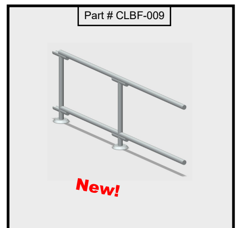
Chain-link Barrier Fence Straight - 2 sections RS HO Scale (1/87)