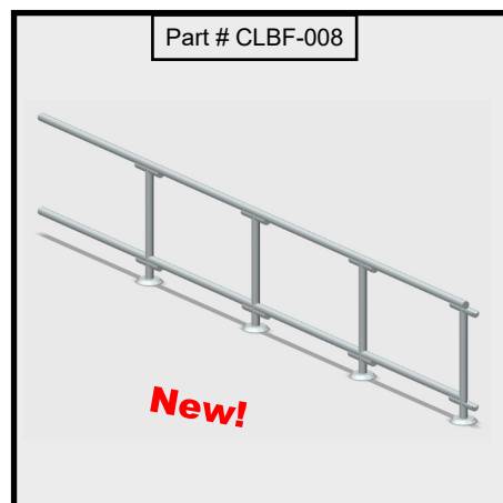
Chain-link Barrier Fence Straight 4-Section LS HO Scale (1/87)