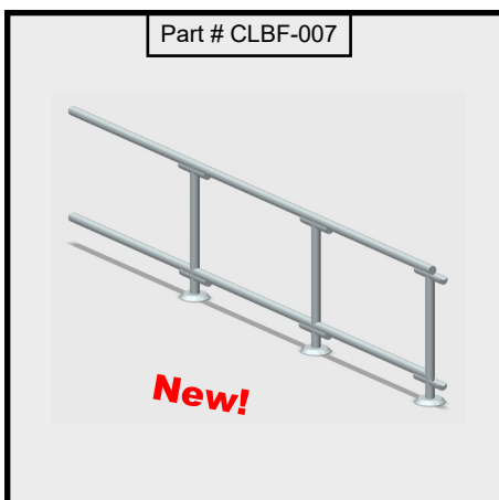
Chain-link Barrier Fence Straight 3-Section LS HO Scale (1/87)