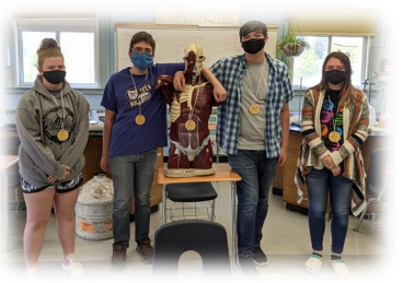
3rd Place Team from Tidioute Community Charter School

In 2020 we saw a unique virtual Warren County Envirothon that featured five students from three area schools; Warren Area High School, Youngsville Middle/High School, and Tidioute Commun -ity Charter School. In 2021 the event repre-