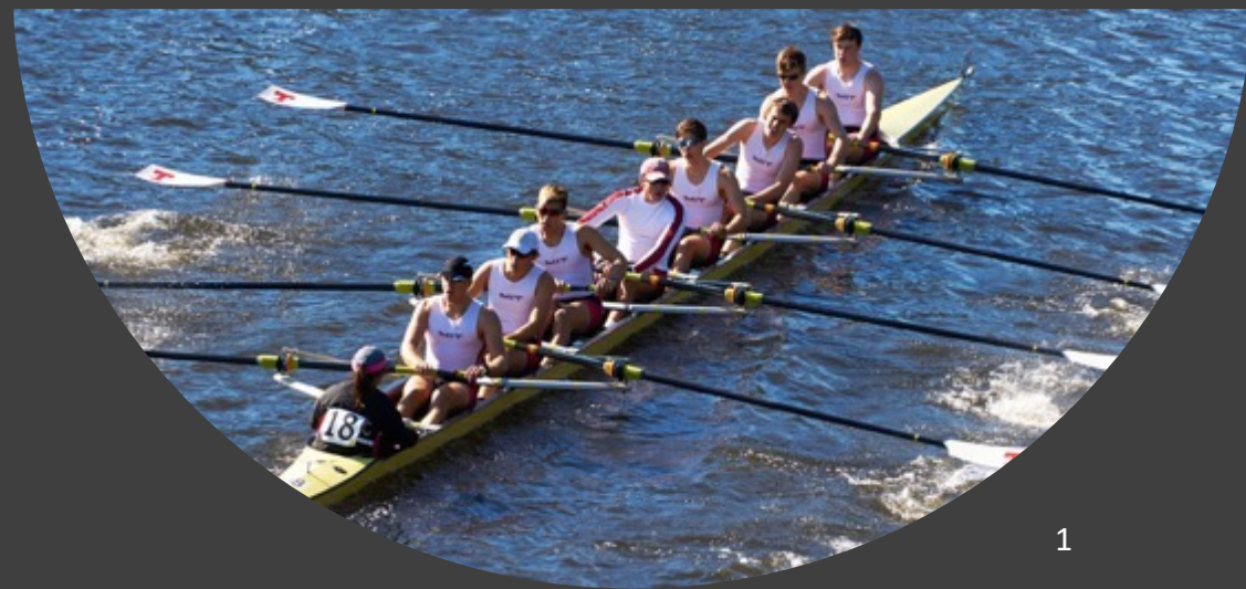
Cover Pix: Orphans rowing at Juba Orphanage circa 2010

Nurturing Exceptional Leadership from Rowing