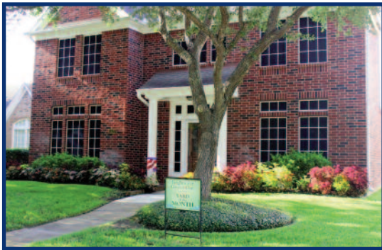
4522 Northshore Court August, 2016 Yard of the Month