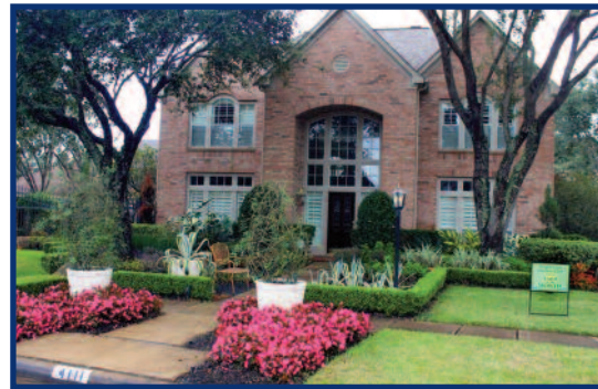
4111 Waterview November, 2016 Yard of the Month