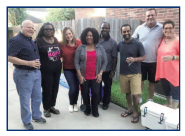
Good neighbors on Midstream Drive

Brightwater is a thriving community of nearly 800 homes, and the rules and regulations we live by are intended to maintain harmony among neighbors and keep our surroundings attractive.