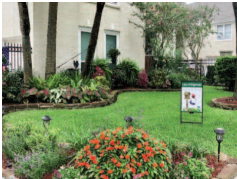
August 1806 Shoreline Drive