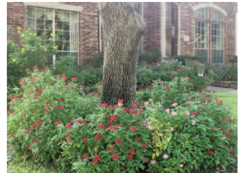
October 1822 Lakefront Drive