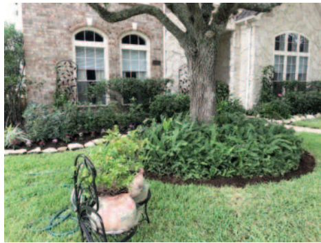
September 4203 Admiral Court