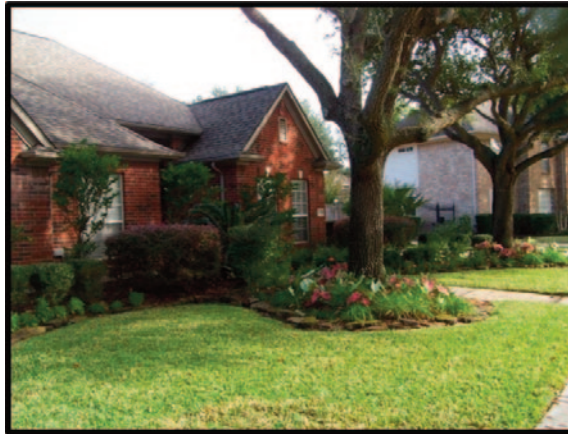
November 2206 Tradewinds Drive

A committee of Brightwater Garden Club members chooses Yards of the Month based on the following criteria: exceptional curb appeal, healthy and well-maintained landscaping, use of color, balanced blending of plants, and no obvious violations of the Brightwater Architectural Guidelines.