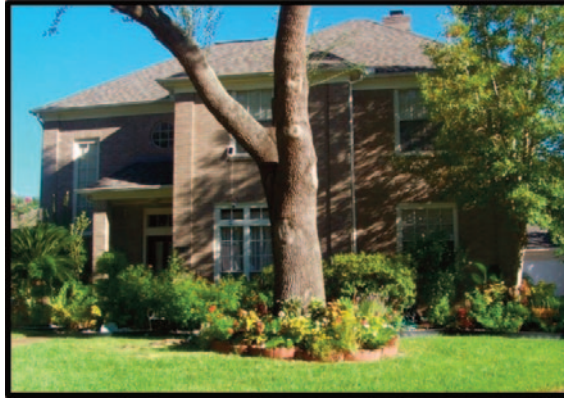
September 4110 Jetty Terrace Circle