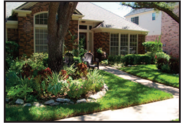
October 1847 Lakewinds Drive