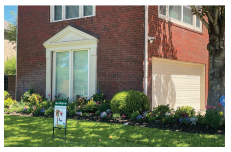
April - 2011 Brightwater Drive