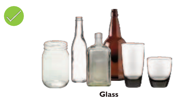
(bottles and jars)