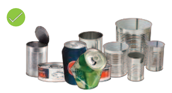
Metal (all cans)