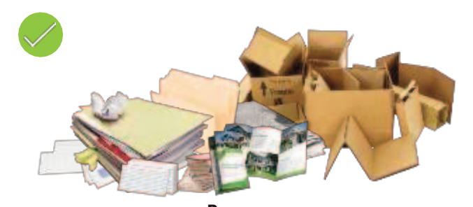
Paper (paper, cartons and cardboard)

TIPS FOR SUCCESS: Empty and rinse your plastic bottles, tubs, jugs, jars, metal cans, glass bottles and jars. Flatten any cardboard boxes. Place items loose in container, NO BAGS.