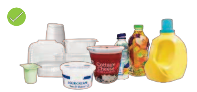
Plastic (#1, #2, & #5) (bottles, tubs, jugs and jars)