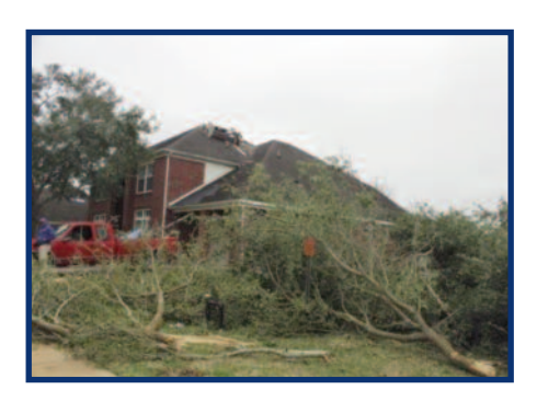
A dislocated chimney on the roof of a house