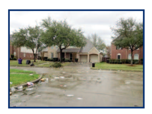
Tornadoes show no respect for trash and pick-up days