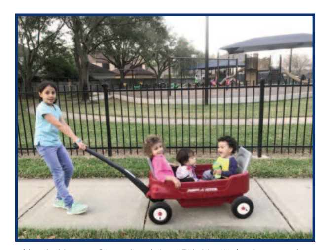
Headed home after a play date at Brightwater's playground

If your kids have more energy than they know what to do with, take them to the recently upgraded playground. It's a great place for them to unwind and for you to meet other parents and grandparents.