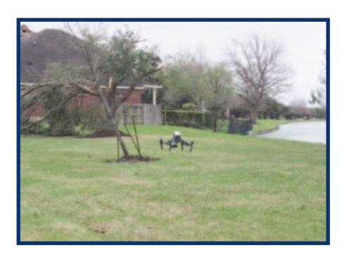
A KPRC drone taking off for aerial shots of the damage

If your trash can or recycle bin was destroyed in the storm, call the Municipal Solid Waste Program at 281-403-5800 to inquire about a replacement.