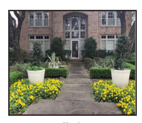
March 4111 Waterview Court