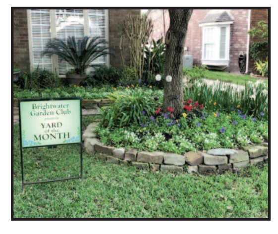
February 1902 Lakewinds Drive

The Brightwater Garden Club is a great resource for those who want to improve their gardening skills. Annual membership is only $25 per individual or $35 per couple. Members receive a directory with monthly program descriptions for the year, a list of gardening resources and local gardening retailers.