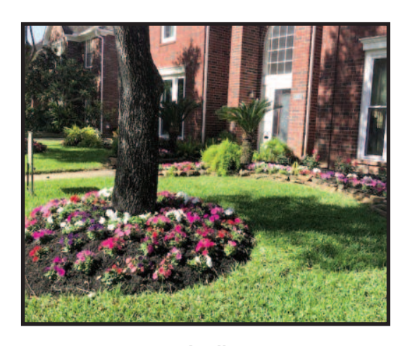
April 1846 Lakewinds Drive