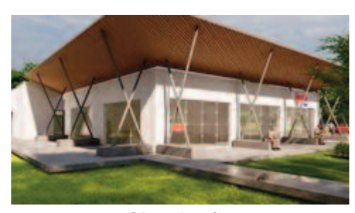
Site plan for Anchor Construction office

As some residents have noticed, Brightwater will have a new neighbor occupying the old swim school on Cartwright Road. Anchor Construction is renovating the facility for their new headquarters with plans to move in this summer. The company specializes in commercial construction, including convenience stores, restaurants, multi-family living and hotels.