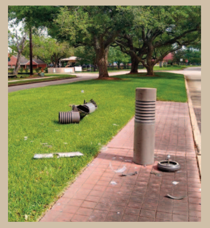
Two of the HOA bollard light fixtures on the median near Cartwright were recently hit in an accident on Brightwater Drive. The Operations Committee will assess the damage and determine how to best repair or replace the lighting on this median.