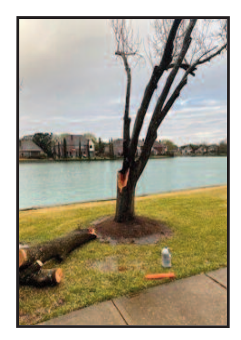
This is what can happen when a Bradford Pear tree ages out.

Many of Brightwater's Bradford pear trees have disappeared in recent years. These have been lovely trees and a welcome harbinger of spring in Brightwater. Unfortunately, they have a limited lifespan and can become a hazard. Without warning, they can drop very large limbs with the potential to do serious damage. One way to extend a tree's life is to