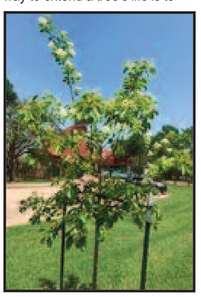
Chinese Fringe Tree

Each year, hardy trees such as oaks and maples are added to the parks and along the green belt that borders the large lake. Brightwater has lovely green spaces and everything possible is done to keep them beautiful and safe for residents.