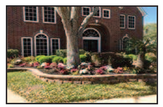
1822 Sea Breeze Court