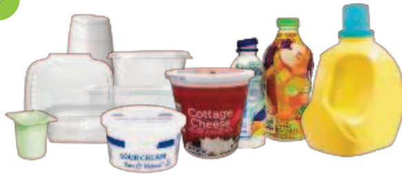
Plastic (#1, #2, & #5) (bottles, tubs, jugs and jars)