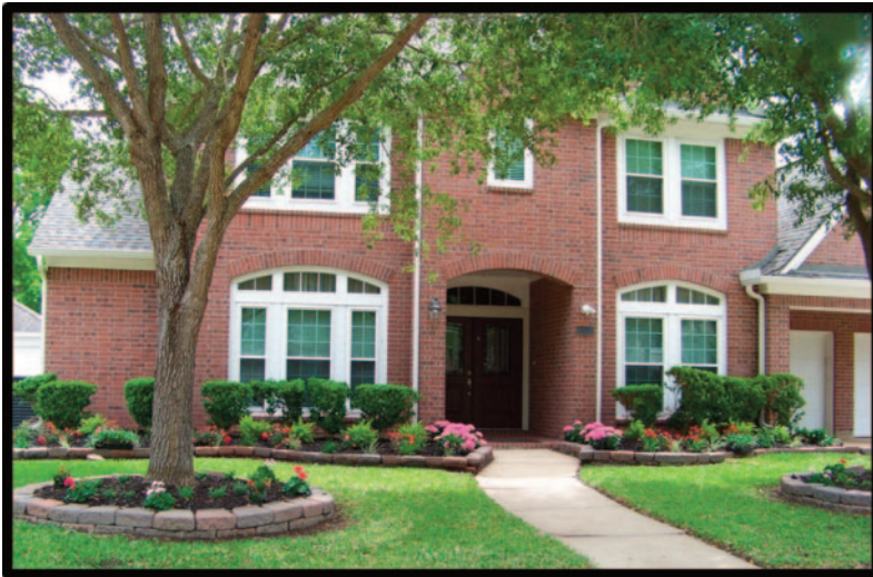
4127 Mooring Point Court