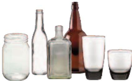
Glass (bottles and jars)