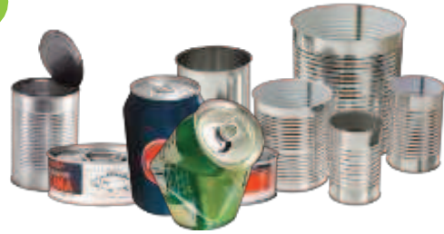
Metal (all cans)