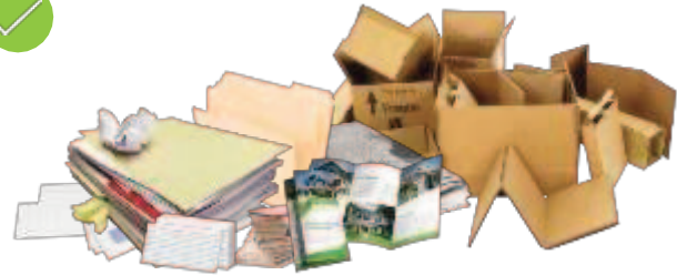
Paper (paper, cartons and cardboard)

TIPS FOR SUCCESS: Empty and rinse your plastic bottles, tubs, jugs, jars, metal cans, glass bottles and jars. Flatten any cardboard boxes. Place items loose in container, NO BAGS.