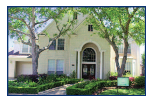
4202 Clearwater Court April, 2016 Yard of the Month