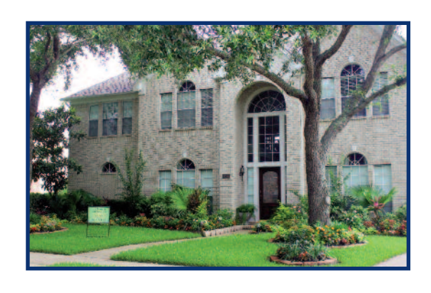
4206 Harborview Ct. June, 2016 Yard of the Month