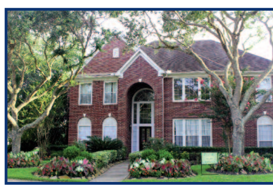
1926 Lakefront Drive July, 2016 Yard of the Month