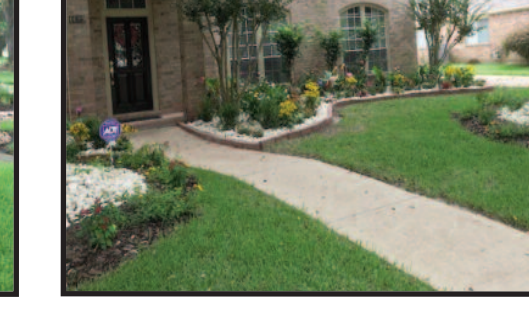
July 2115 Westshore Drive