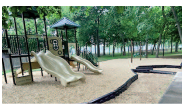
Northshore Park after improvements

Brightwater is known for its beautifully maintained grounds with exquisite beds of colorful flowers and attractive plants. Of equal importance is safety, especially at the playgrounds little ones frequent. Community volunteers spend many hours attending to both beautification projects as well as making certain that amenities are safe to use. Examples of playground upgrades and repairs in recent months include the following: