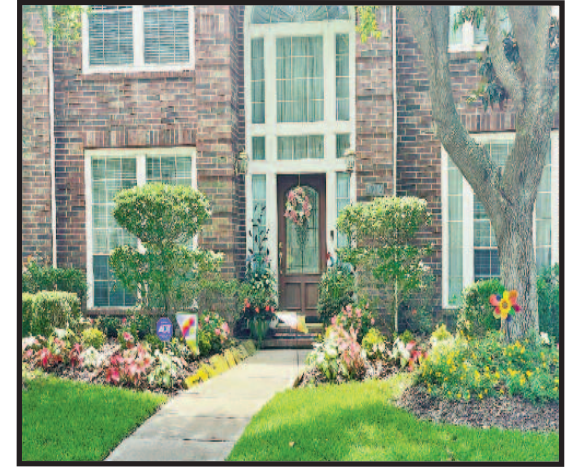
June 1710 Starboard Shores Court