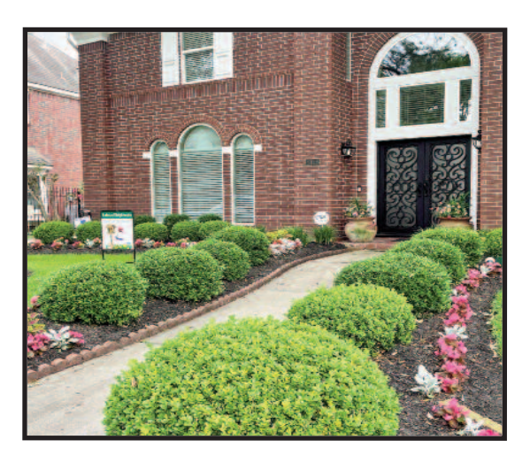
May 4115 Jetty Terrace