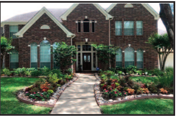
May: 1923 Lakefront Drive