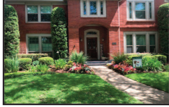
June: 4110 Mainsail Circle