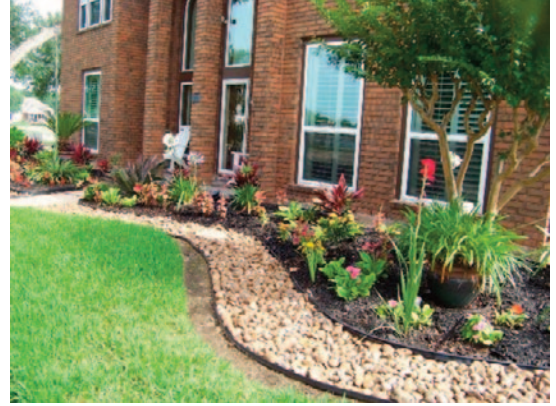
June – 4106 Frost Lake Circle