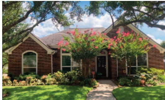
July – 1835 Brightlake Way

Please be courteous to residents walking on Brightwater sidewalks. If you are riding a bike and approaching walkers, call out to let them know you are passing.