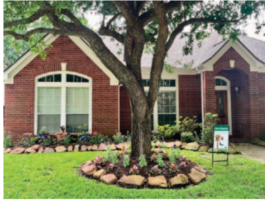
May – 1814 Lakewinds Drive