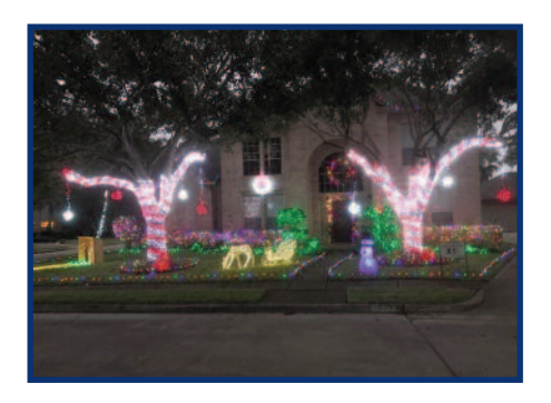
1834 Sea Breeze Court