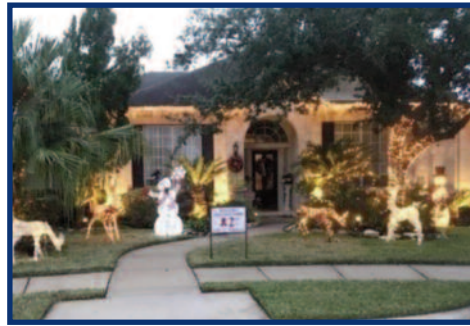
1502 Waterwood Court