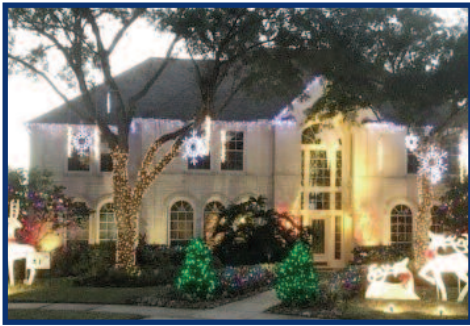
1826 Seabreeze Court