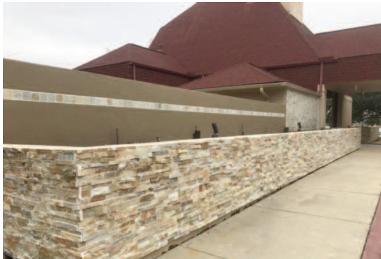
New finish for old wall in front of Clubhouse

Brightwater is the place to live in 2018! Our Refresh project will wrap up as it completes Phase III. The Clubhouse will get a face lift and you will notice finishing touches being made to our landscaping and flower beds. Although we've heard, "Columns? What columns?" there are columns along Brightwater that will undergo a makeover. Thereafter, the columns may catch your eye by being much more attractive and consistent throughout the community.