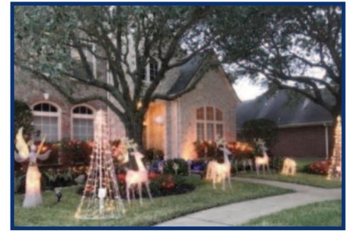
4103 Admiral Court

Best Block – Eastshore Drive Best Cul de Sac – Westshore Court