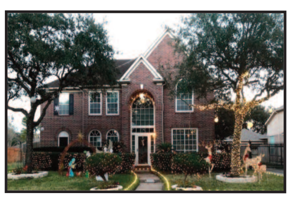
Third Place 1711 Lakewinds Drive

Brightwater's Lexington entrance was graced with a cheery corner home that said NOEL to the traffic coming and going. A brightly lit nativity scene with kings and shepherds and an arching star celebrated the season. A glowing snowman pointed the way to a candy cane entry guarded by a tall nutcracker and a spiral tree under dripping icicles.