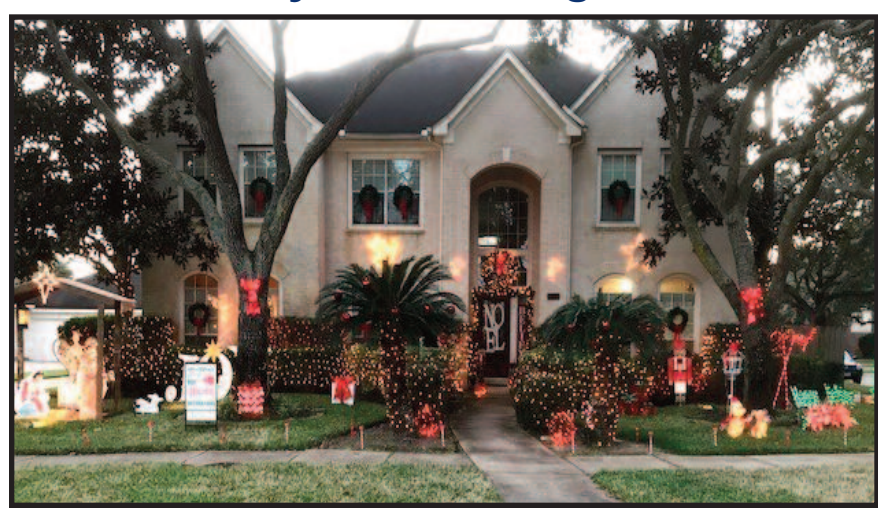
First Place 1706 Lakewinds Drive

This repeat winner celebrated many aspects of the holiday season. On one side of the beautifully illuminated yard, a glittering nativity scene and a watchful angel sent a message of joy. On the other side, candy canes, glowing presents, a solemn nutcracker sentinel, a bright lantern, festive woodland creatures, and a green spiral tree reflected the fun side of the holidays. The front door, with its brightly lit holiday greenery and wreath, bid a happy "Noel" to visitors.