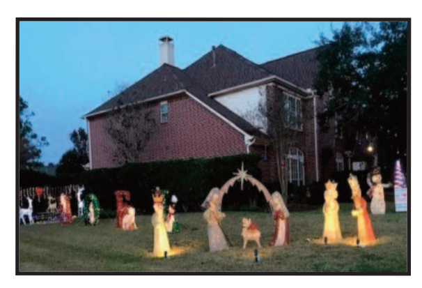
Second Place 4322 Lakeside Meadow Drive

Brightwater's Lexington entrance was graced with a cheery corner home that said NOEL to the traffic coming and going. A brightly lit nativity scene with kings and shepherds and an arching star celebrated the season. A glowing snowman pointed the way to a candy cane entry guarded by a tall nutcracker and a spiral tree under dripping icicles.