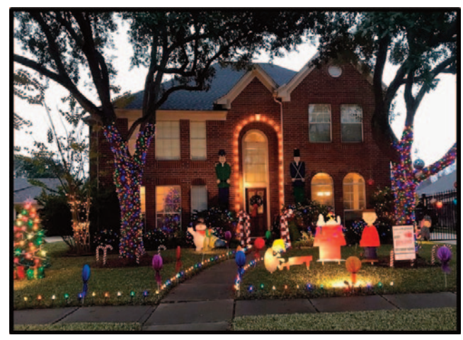
First Place 4519 Northshore Court

It was delightful to see so many beautifully decorated homes in Brightwater during the holidays. This year's first place winner displayed two tall toy soldiers which flanked the home's entry, and the yard was filled with colorful lights that ringed the oaks and bordered the walkway. Lollipops and candy canes added a sweet touch along with a smiling snowman waving a welcome. Charlie Brown and his Peanuts friends celebrated the holiday. and Winnie the Pooh characters dashed toward the driveway where the iron gate was festooned with large, old-fashioned light bulbs on a lighted wreath with a red