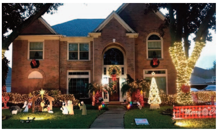
Third Place 1710 Lakewinds Drive

Lights shone brightly throughout this beautiful yard. A lovely nativity scene was accompanied by seasonal messages of "Joy," "Noel" and "Happy Holidays." The sago palms were wrapped with lights as were the landscape beds, and a dove and star lit the walls of the home. A reindeer pulling a giftladen sleigh was joined by a singing mouse family, toy soldier, wrapped gifts, peppermints and a green spiral tree. A large lighted wreath above the door and green wreaths in all the windows rounded out the display.