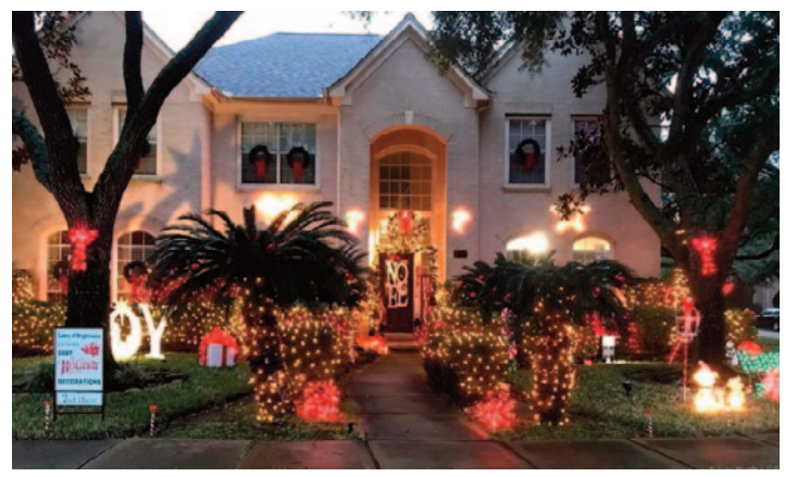
Second Place 1706 Lakewinds Drive

Lights shone brightly throughout this beautiful yard. A lovely nativity scene was accompanied by seasonal messages of "Joy," "Noel" and "Happy Holidays." The sago palms were wrapped with lights as were the landscape beds, and a dove and star lit the walls of the home. A reindeer pulling a giftladen sleigh was joined by a singing mouse family, toy soldier, wrapped gifts, peppermints and a green spiral tree. A large lighted wreath above the door and green wreaths in all the windows rounded out the display.