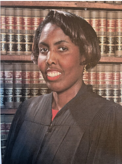
Judge Toni A. Bean, The second African- American to serve as a Suffolk County District Court Judge

Please continue to keep their families in prayer.