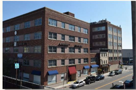
53 N Park Ave, Rockville Centre

GAZ Realty Properties www.gazrealty.com 516-536-5500