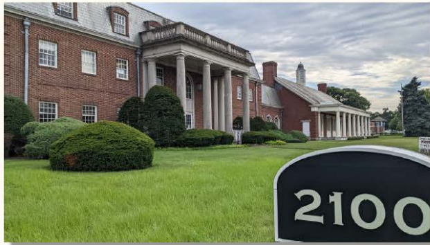
2100 Middle Country Rd, Centereach