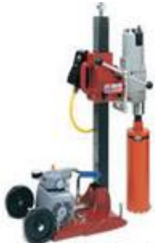
Combo Fixed Base