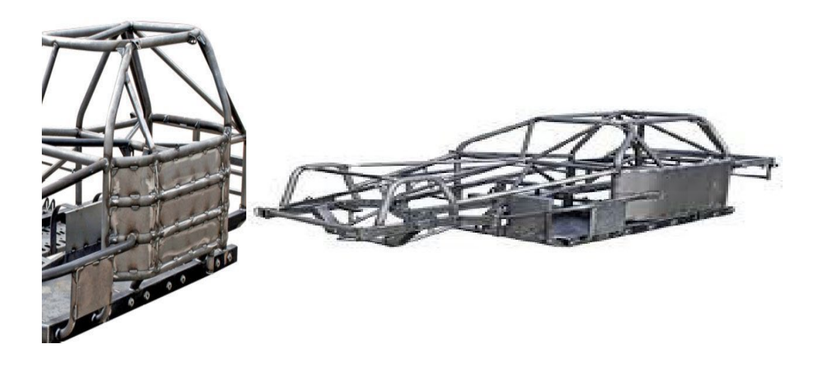
Illustration pictured below.