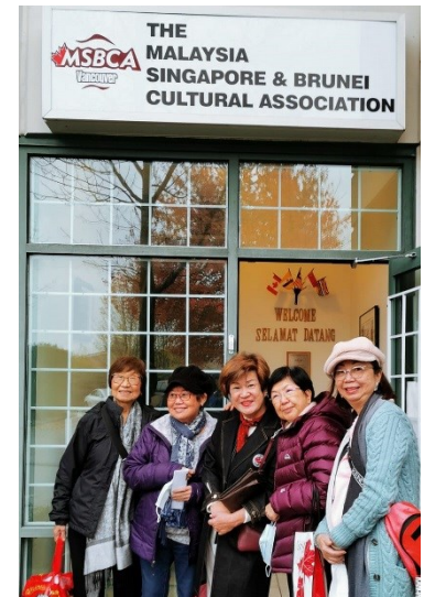
Above photo: Some of the members held a private luncheon at the clubhouse. About 20 of them enjoyed two hours of fun and fellowship over a pot-luck lunch. Six of them became members to support the Association.