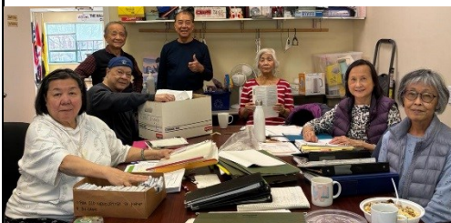
Spring Clean-up took place on March 20th, 2024 by the directors and assistants. Clearing out old documents and giving the floor another shine.