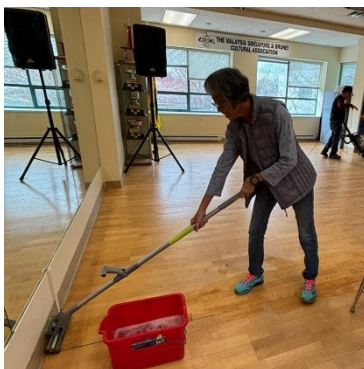
Assistant Say See giving the floor a clean up job.