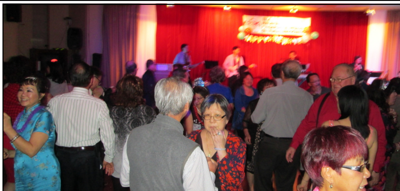
Photo showing some of the 220 guests enjoying the dance music by the Northern Lights during the countdown at the New Year's Eve Party in Floata Seafood Restaurant.