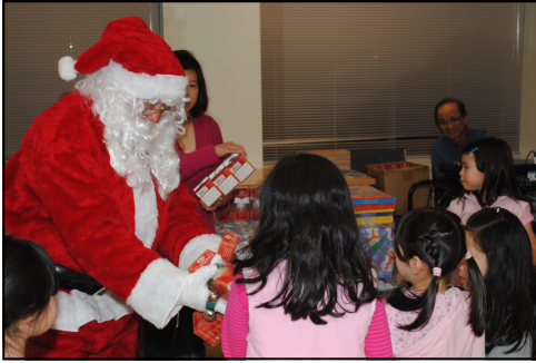
Below: Children sharing stories of Christmas while waiting for Santa to arrive from north Pole. Santa did arrive after all.