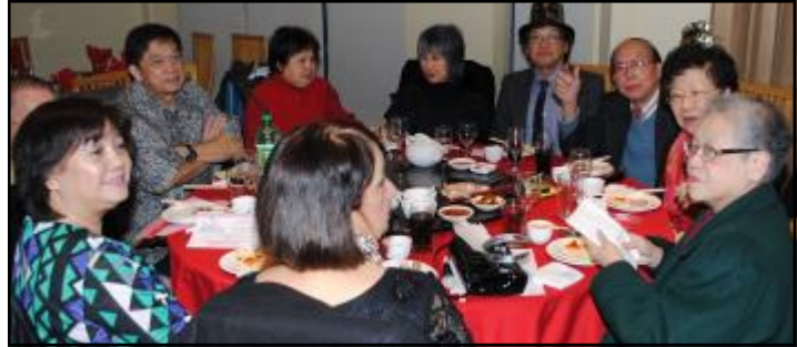
Ringing in the New Year 2015 at the Floata Chinatown on December 31, 2014.