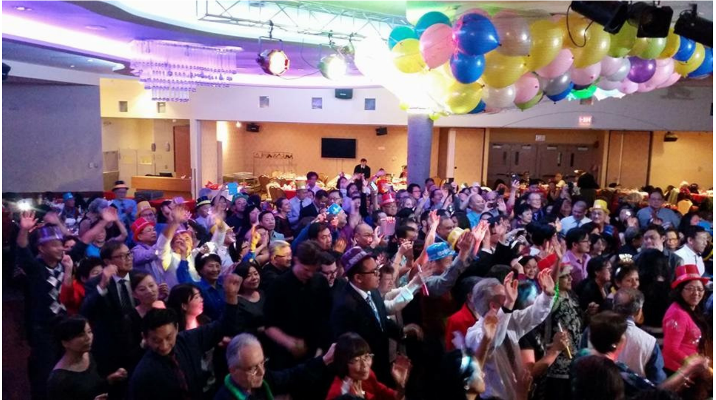
Celebration took place at the Floata Chinatown on December 31st, 2015. Party revellers took to the floor for the joyous ringing in of New Year 2016. The sound of balloons popping like fire crackers and New Year's toasts are something of an experience you would not want to miss this coming December!!!