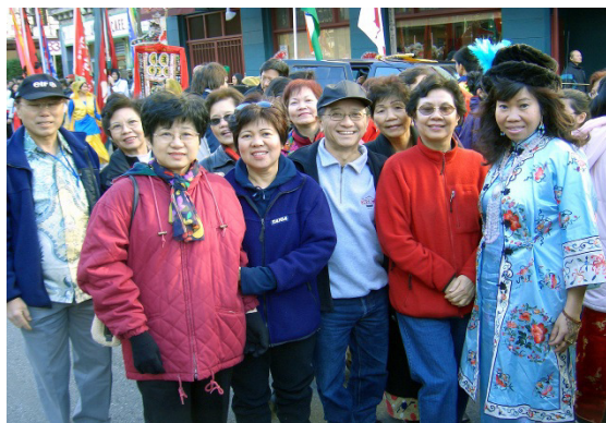
On February 13, 2005, members took to the street, not in protest, but to join in the parade in Chinatown, Vancouver. MSBCA was invited by South East Asia-Canada Business Council to join in the parade.