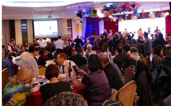
New Year's Eve Dinner and Dance— December 31, 2023 More photos and a write up on the Website.

Thank you to all Directors and Assistants who helped out during the New Year's Eve Dinner and Dance. Thank you to the volunteers: