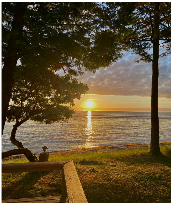
Photo sent in by a Director while vacationing in her summer home on Mayne Island, BC. The island is one of the Gulf Islands in the Strait of Georgia between Mainland British Columbia, Canada and Vancouver Island. The sunrise photo taken at 5.30 am.