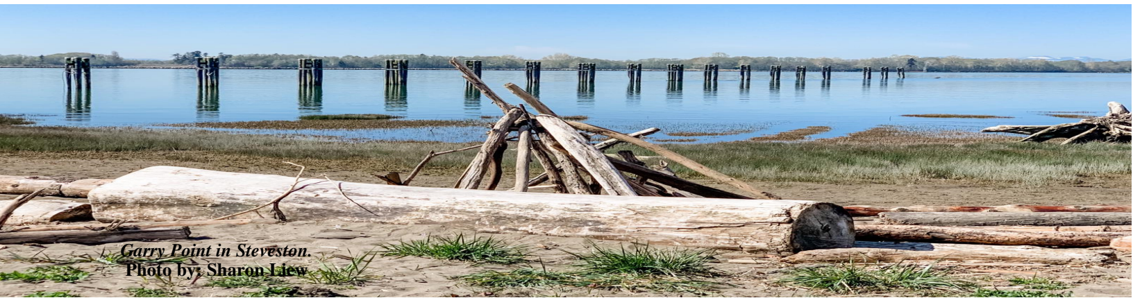
Garry Point in Steveston.