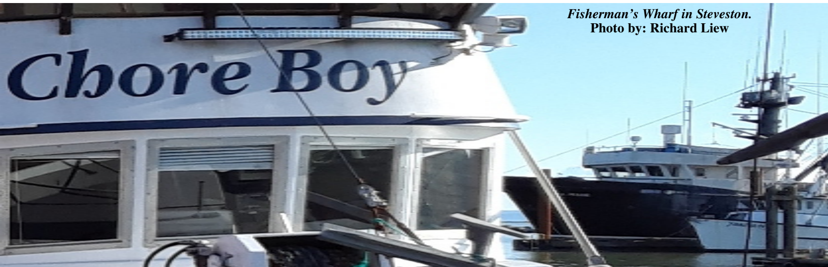
Fisherman’s Wharf in Steveston.

For the time being, let us stay calm and strong! We wish our members a safe and healthy Summer!