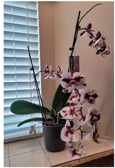
The five years spent caring for the Phalaenopsis Orchid finally came to full bloom on three spikes for the first time.