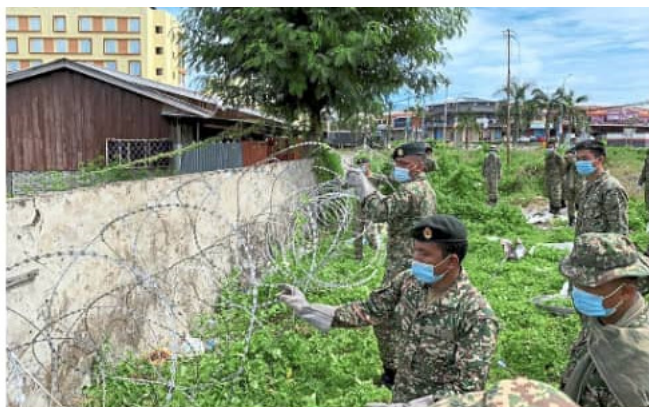
No entry: Army personnel installing barbed wire in Semporna.