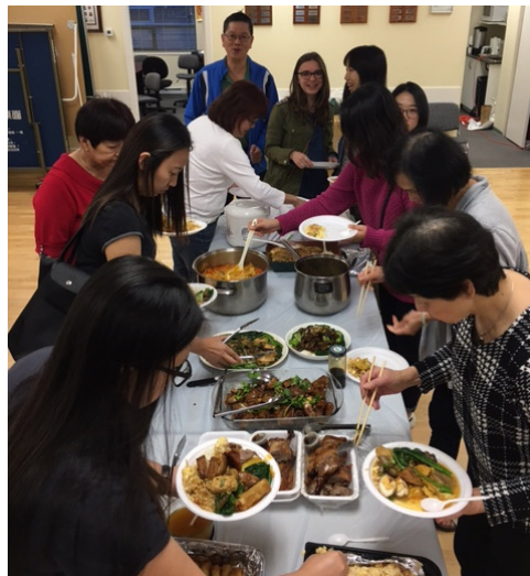
Snapshots of Family Potluck at the clubhouse on September 24th, 2016.