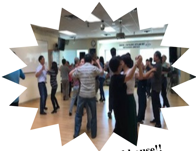
Ballroom at the clubhouse!!