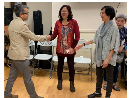
Photos from the MSB Social Night at the Clubhouse on September 28, 2019.